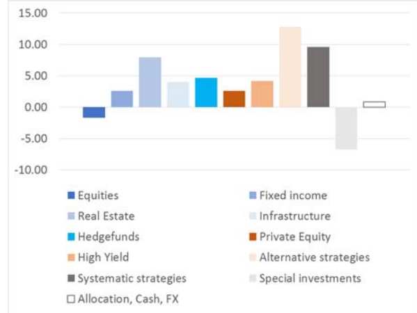
Return %, Jan–Jun 2016