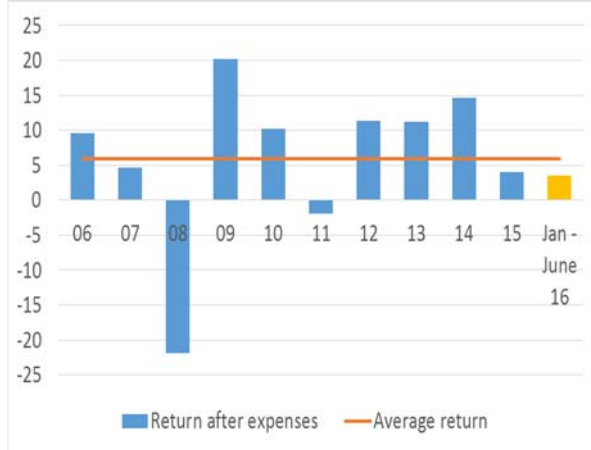
Return after exp. 2006 – June 2016, %